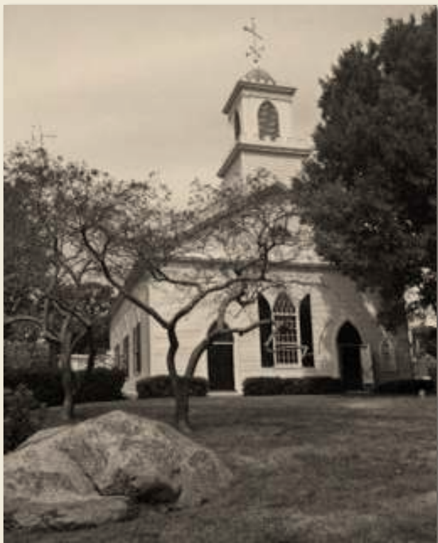
Above - The historic Annisquam Village Church